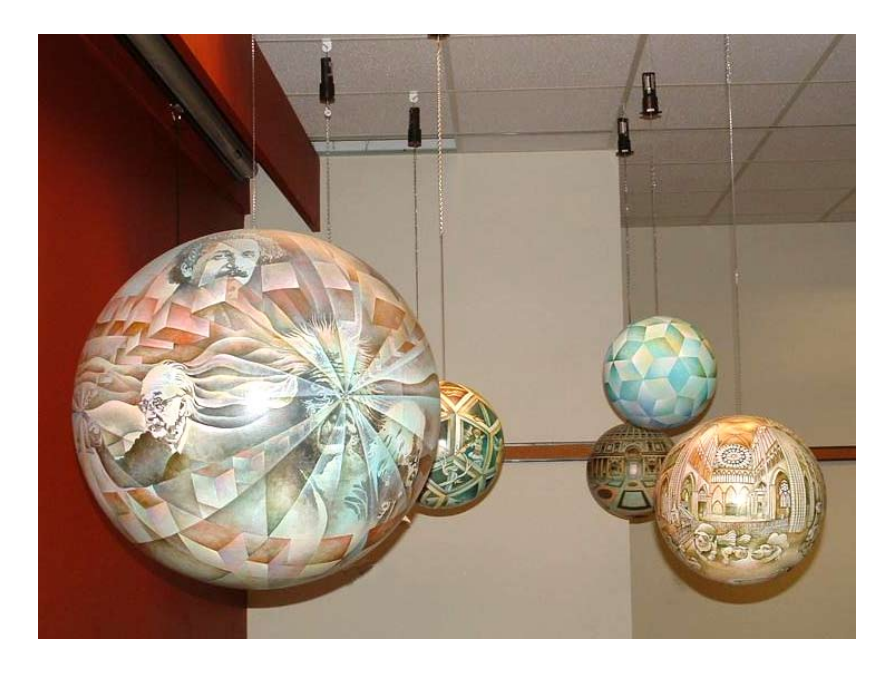
Figure 4: Some of Dick Termes' spheres