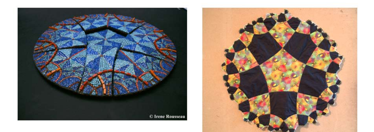
Figure 3: Two hyperbolic tesselations: Irene Rousseau and Mary Williams