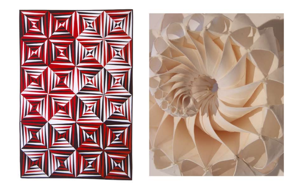
Figure 2: Quilt by Gerda de Vries; paper spiral by Bradford Hansen Smith