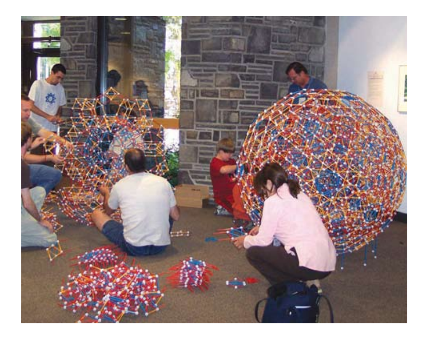
Figure 7: Community building of the 3D shadow of the cantellated 600-cell

around the world in a highly enjoyable, stimulating, and encouraging atmosphere of mutual exchange and appreciation. It had a public component (the art gallery, and the lecture on Coxeter) that drew a capacity crowd to the Max Bell auditorium. It sponsored an innovative new play that went on successfully to run as an off-Broadway production in January-February of 2006.