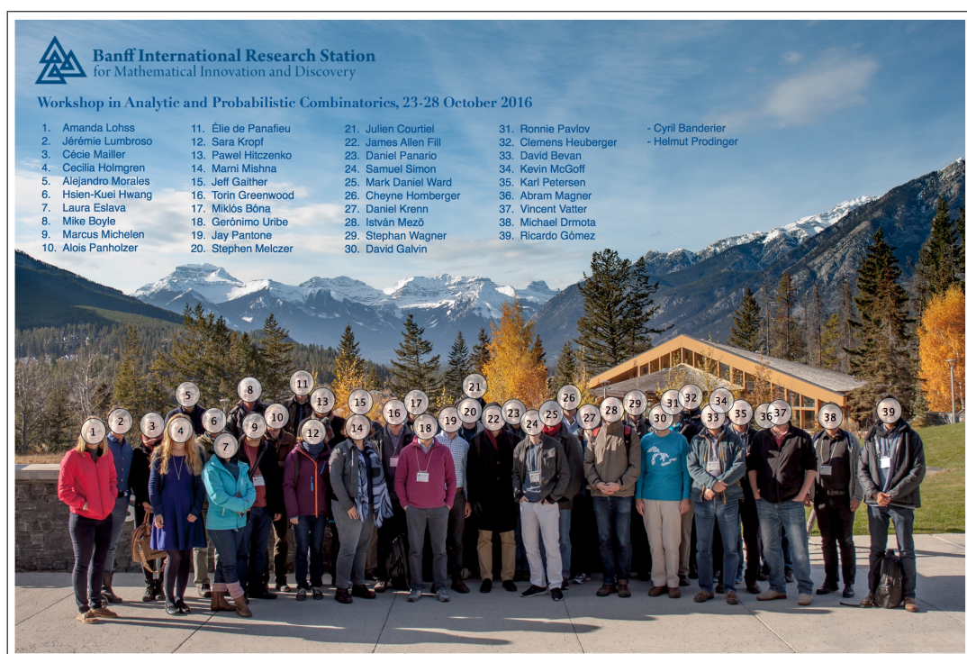
Figure 2: Participants of the Workshop in Analytic and Probabilistic Combinatorics, Banff 2016.